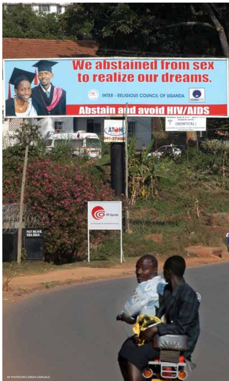
A billboard in Kampala, Uganda advises people to abstain from sex. Billboards urging condom use have disappeared from the capital. In their place are posters, some funded by the United States, encouraging youth to delay their sexual debut until they marry.

Another factor that probably contributed to the decline in HIV/AIDS prevalence is the rise in the number of AIDS-related deaths, since antiretroviral treatment was not widely available in Uganda at the